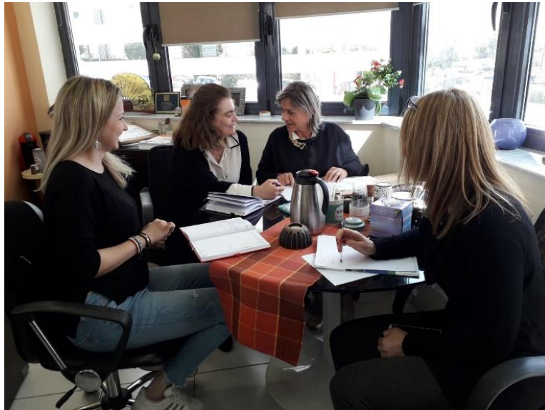
CERTH-PED Epirus meeting

The SUSTOURISMO Kick off Meeting was organized on February, 27 th and 28 th , 2020. Due to the Covid-19 outbreak and all the restrictions imposed for limiting the pandemic spread, the meeting had to be cancelled. Instead, bilateral skype call meetings took place between the Lead Partner and each partner separately, except for the PED Epirus case, as the meeting was held in CERTH's premises. During these meetings, initial ideas about the design and implementation of each pilot case were discussed, in order for all partners to have a common approach and establish strong foundations for the promotion of sustainable tourism via sustainable mobility in their pilot areas. Managerial and financial issues were also discussed and clarified, ensuring therefore that crucial issues for the project's upright implementation will be taken into account by all partners throughout the project's duration.