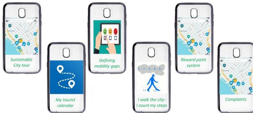
The SUSTOURISMO app functionalities

In order to ensure the best possible exploitation of the application, as well as the promotion of sustainable transport modes within the pilot areas of the project, a rewarding point system will be developed and integrated within the app.